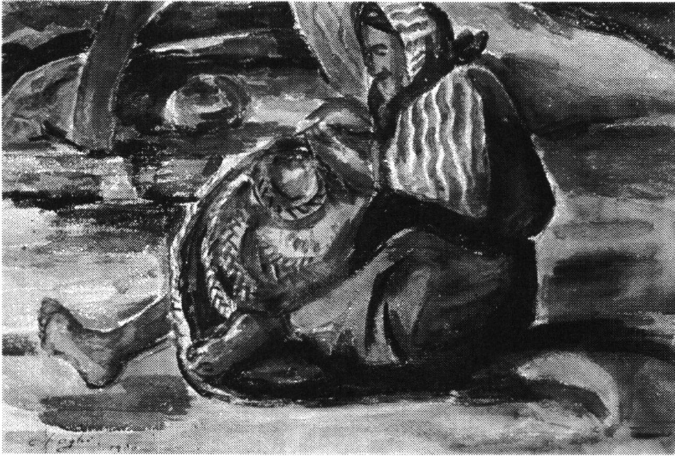
Figure 3: "The Basket Maker"