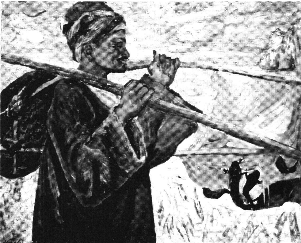
Figure 4: "The Fisherman"