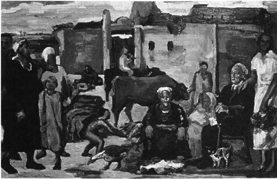
Figure 1: "The Family in the Village"