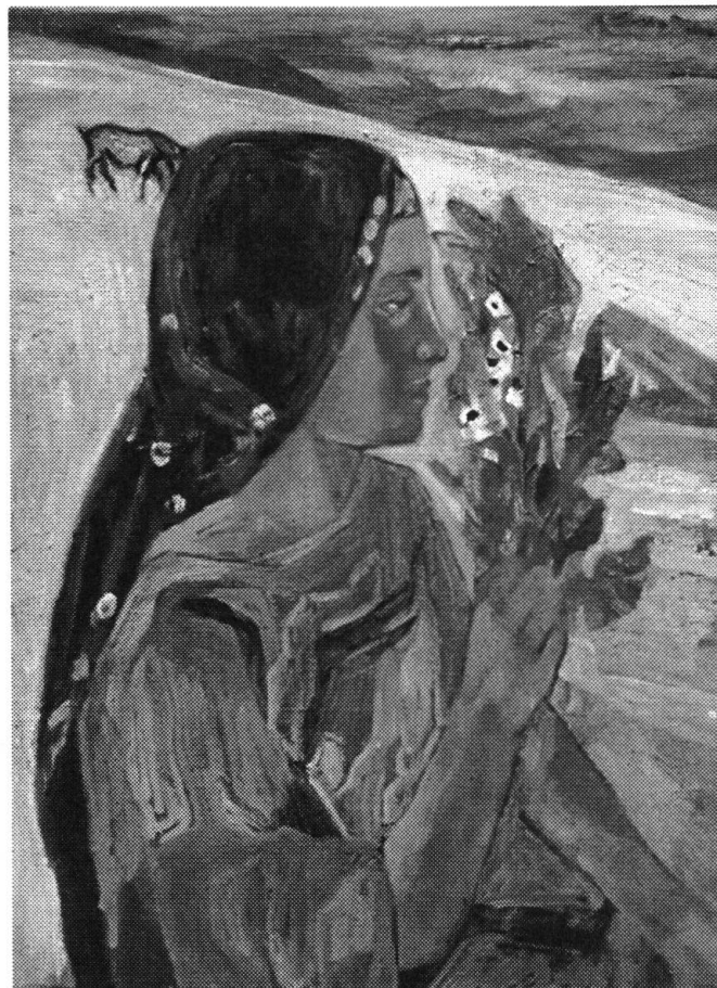
Figure 2: "Girl with Bean Flower"