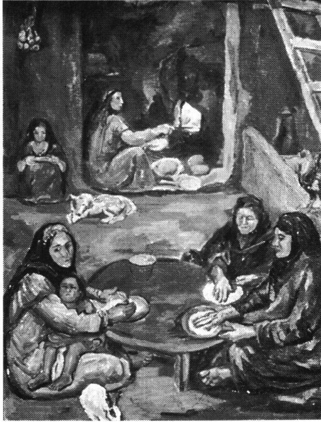
Figure 5: "Women Making Bread"