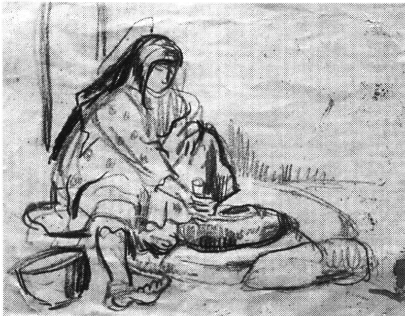
Figure 6: "Woman Grinding Corn"