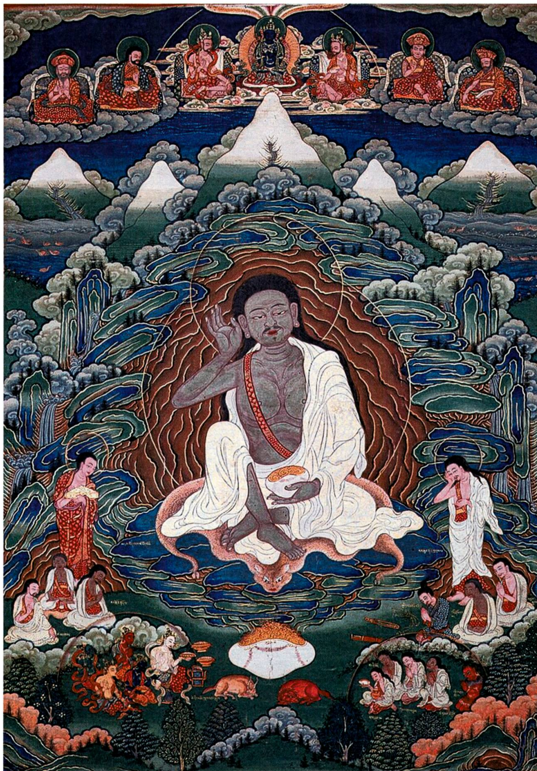
Figure 3: Bhutanese painted thanka of Milarepa, Dhodeydrag Gonpa, Thimphu.