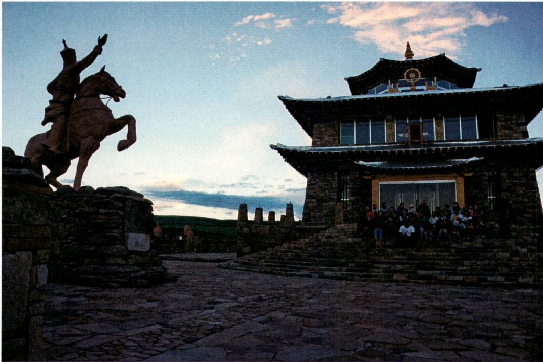
Figure 4: The statue of D. Sükhbaatar at Zawa Damidin Rinpoche's temple in Dundgovi.

socialism was so magical that it could affect people even after its collapse 30 years in the past.