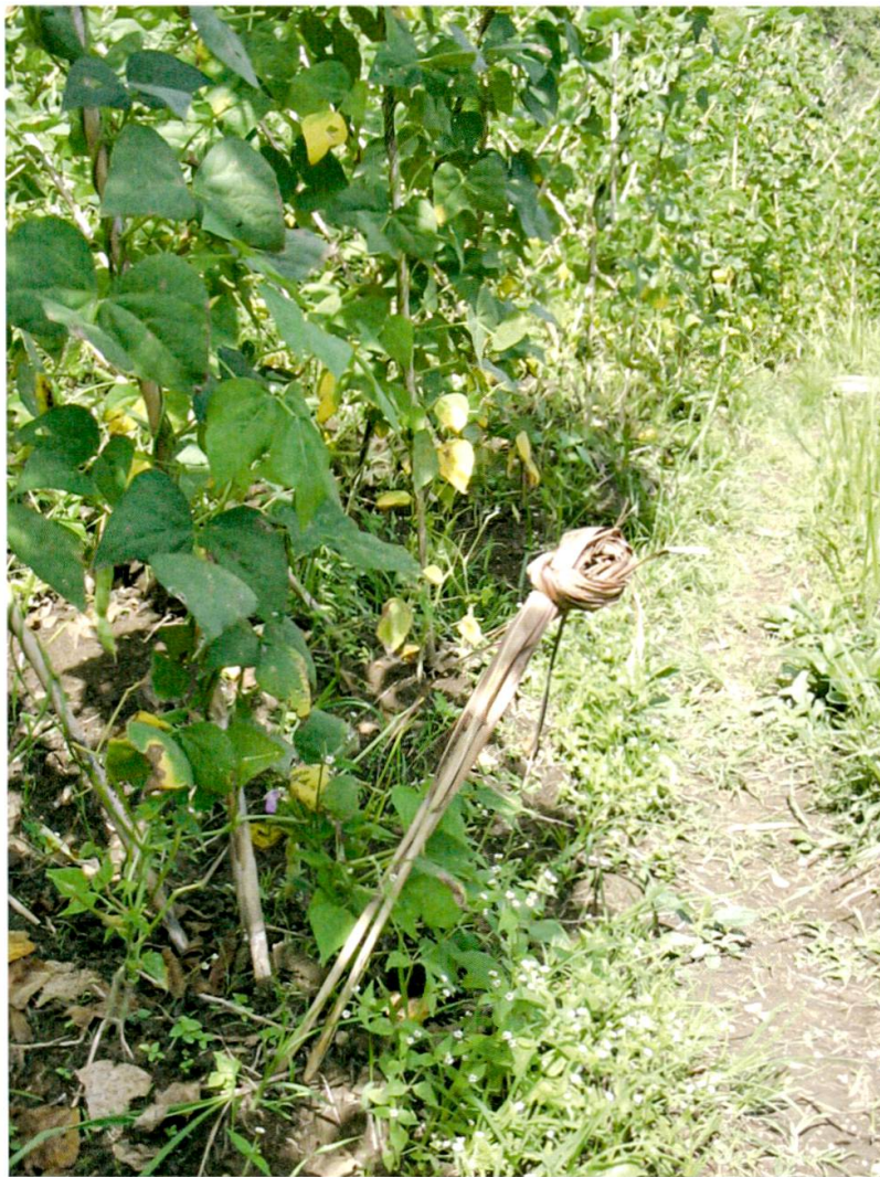
Figure 3: Pudung knot protecting field.

When Duntugan had finished planting his rice field, he put up a fence of pudung knotted grass straws around his field to protect against the retrieval of the life force of the rice by malicious forces (Figure 3). According to Duntugan,