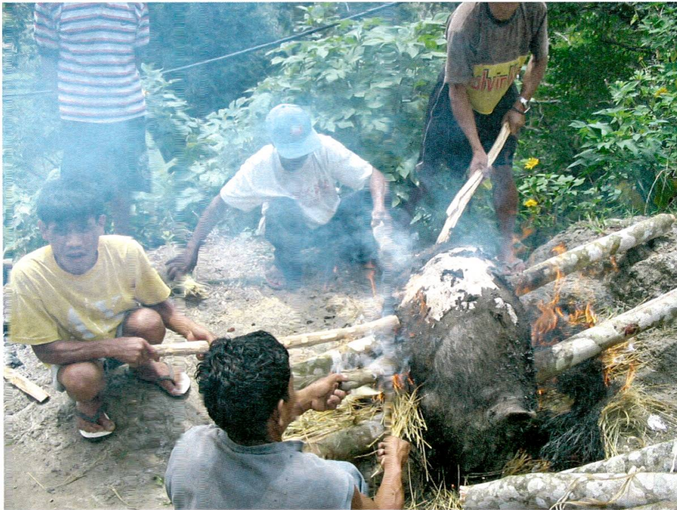
Figure 1: Singeing sacrificed pig.