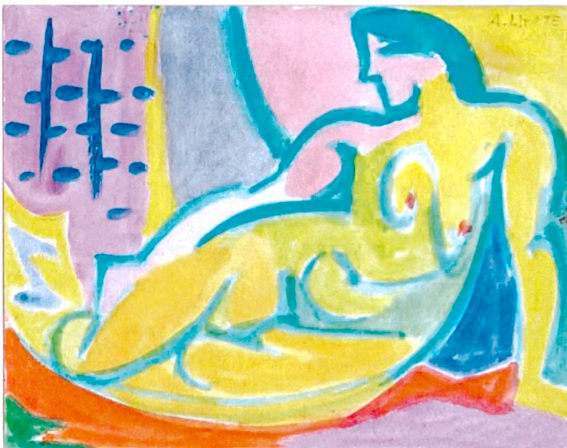
Figure 4: André Lhote, Odalisque , 12 × 16 cm, watercolor on paper, private collection.

For Haşmet Akal, the formula for this magic was no doubt to attend the studio of André Lhote (Figure 4). Through his writing, Lhote took Cubism beyond the period during which it prevailed in Paris; he took it beyond the French borders, especially through his studio classes where he mostly taught foreign students. During the years following the founding of the Republic of Turkey, for those who went from Istanbul to Paris, “the torch of art” was in his hands and in his academy. 53 This torch was passed from generation to