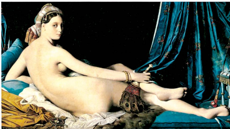
Figure 1: Jean Dominique Ingres, La Grande Odalisque , 88.9 × 162.56 cm, oil on canvas, 1814, Musée du Louvre, Paris.

La Grande Odalisque (Figure 1) – perhaps the most famous among women who do look back – would stay in the “petits appartements”, the most modest of the Murat residences, there on the wall where it was carefully placed as a pendant to La Dormeuse de Naples purchased previously, again from Ingres. While the “Grande” Dormeuse – thought to have been a portrait of a sleeping woman with her right arm languidly resting above her head – had her eyes closed, 4 the Grande Odalisque must have witnessed the invasion of the palace by rebels and the disappearance of some of the paintings from the Murat collection. Indeed, the Dormeuse has never been seen since. As for the Grande Odalisque , which the Murats left behind in May 1815 together with their power and without having paid it off, it mysteriously reappeared in September of the same year on