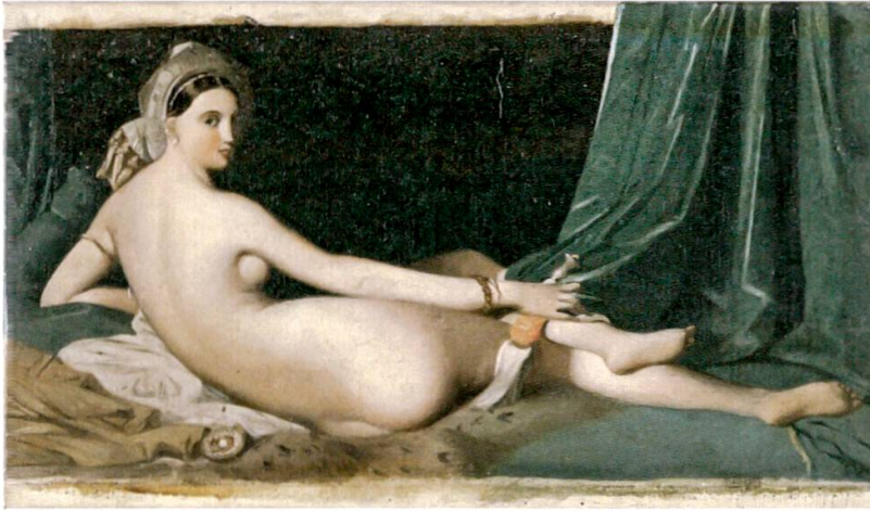
Figure 2: Jean Dominique Ingres, La Grande Odalisque , 14.3 × 24.3 cm, oil on canvas, private collection, Paris.

1818, Ingres produced a copy of the first copy of the Odalisque . This head of Odalisque , 12 which adds to the historical significance of the Stamaty drawing, is now preserved in the Louvre. Ingres would later reproduce two more versions of his own version of the head, while the complete painting was reproduced, again by Ingres himself, at least four more times throughout the 1820s. In each of these versions, the artist would alter one or more objects, details of the setting, jewellery worn by the model, or his colour palette.