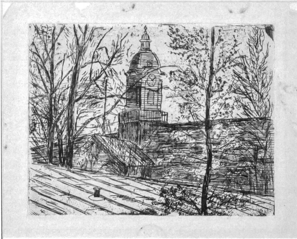
Figure 8: Malik Aksel, Untitled – View of the backyard of the Academy of Fine Arts in Berlin, between 1929 and 1931. Etching, 18.0 × 14.0 cm.

given classes in the Academy building, as his studio, with its 36m 2 , was big enough for teaching. 77 Moreover, among Malik Aksel's texts in which he recorded conversations and observations made during the third State Painting and Sculpture Exhibition in Ankara in 1941 is a very detailed description of the process of selecting nude models for the drawing classes at the Academy on the Stein-Platz, the square right in front of the main entrance of the Academy building. 78 Even though written as if simply overhearing the account of a third person and with a considerably satirical voice, Ayvazoğlu has justifiably interpreted the described experiences of the practices at the Academy in Berlin as Aksel's own experiences, and concludes that Aksel had frequented the Academy building and the drawing classes there on a regular basis. 79