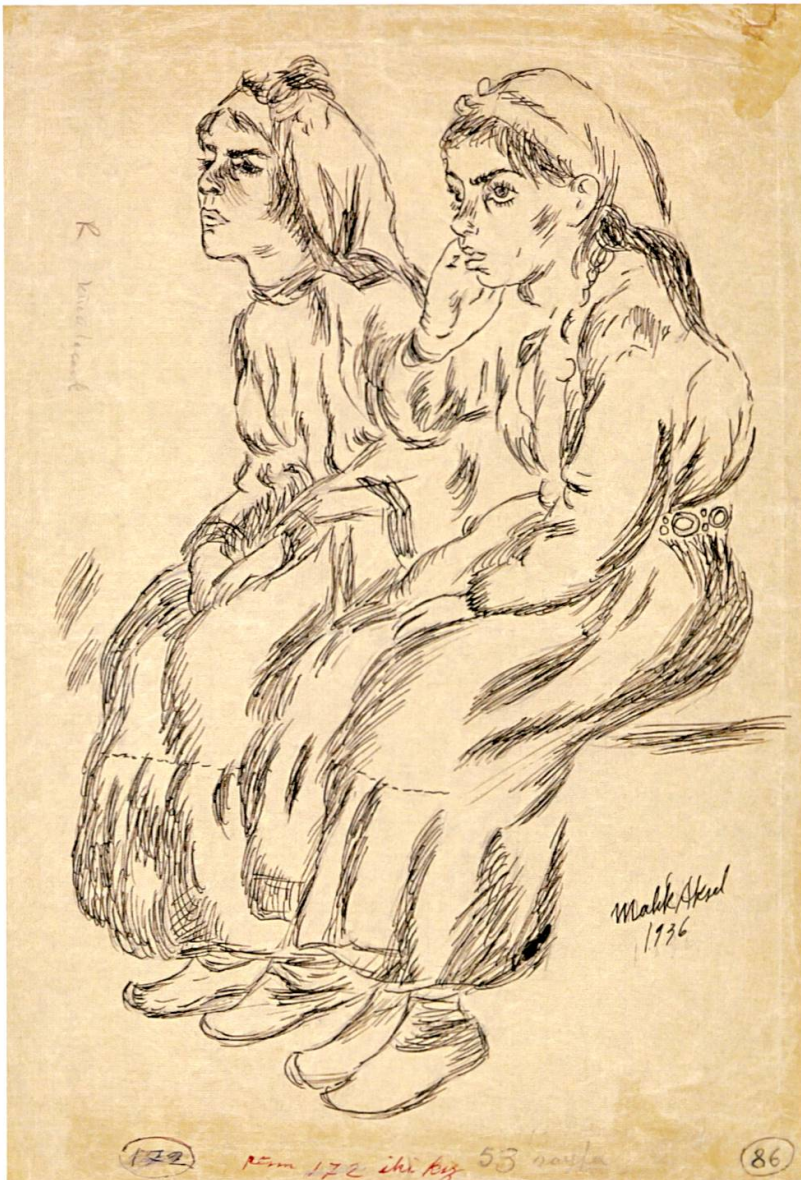
Figure 6: Malik Aksel, Untitled , 1936, Ink on paper, 28.0 × 20.0 cm.

the human figure: Aksel did not objectify the individuals posing for the studies, but portrayed the individual in their integrity.