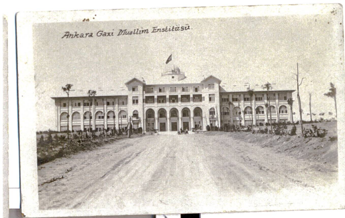
Figure 3: Gazi Education Institute, ca. 1932.

By 1929, the building of the Gazi Education Institute loomed far beyond Ankara's urbanized area, outside of its mapped and even its planned terrain, on the steppe soil typical of the region. It was easily the largest construction in the city (Figure 3); it was also the most expensive building in the entire country so far, and consumed over six percent of the budget of the Ministry of Education during its three-year construction. 37 The expenses soared not least because of the Institute's imported state-of-the-art equipment, not only the general installations for heating, kitchen, and bathrooms, but also the multiple facilities, such as cinema, darkroom, radio station, and laboratories, for the training and leisure of the students and faculty members. 38 The Gazi Education Institute was a boarding institution conceived for 500 students. 39 Accounts from former teachers and students indicate that the building and its facilities were perceived as luxurious and progressive, and the atmosphere in the classrooms and daylight-