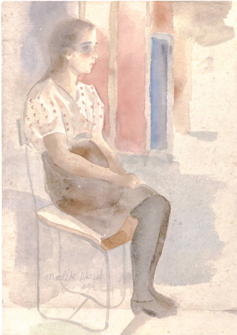
Figure 2: Malik Aksel, Untitled – Girl on a chair , 1935. Watercolour, 45.0 × 32.0 cm.

Dessau, Germany, in 1926, there was no chair made of this material. If the represented chair is not merely an invention in reference to modernist furniture, the painting shows either an import or a local experiment with that style and material. The primary blue and red colours and the straight lines in the background further stress the modernist look of the depicted setting. The girl wears a light summer blouse with short sleeves and a skirt short enough to expose her knees and her legs in dark stockings. The girl's expression and posture, however, do not reflect the lightness of the furniture, colour, and summer blouse, and none of the liberation that was promised to come with modernization. On the contrary, she is sitting as one would sit in an unfamiliar environment: she