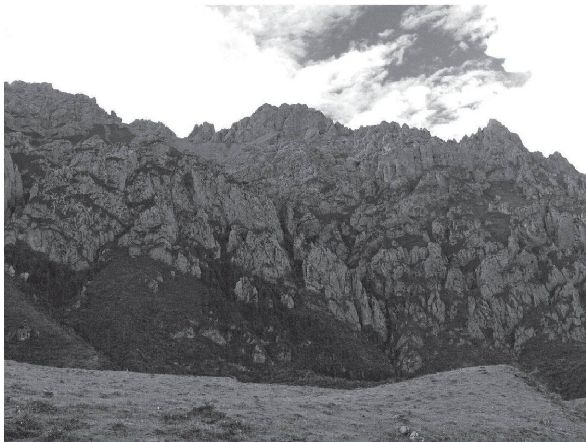
Plate 5: Dragkar Jagoe ( Brag dkar bya rgod).