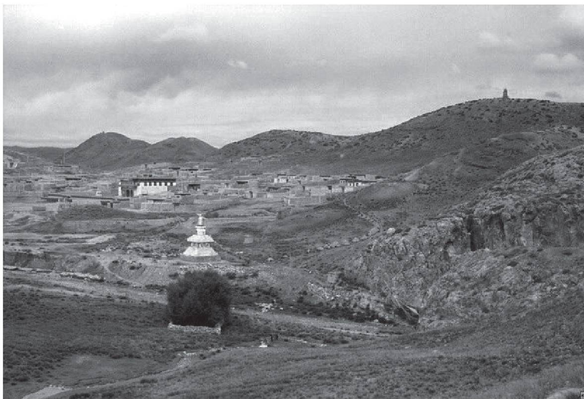
Plate 1: Tsezhig monastery (photo by D. Berounsky, 2003).

The first monastery, which traces its foundation back to the legendary zhigpo and disciple of Zhugom Trulzhig at the same time, is Tsezhig monastery located in the locality called Gengya ( rGan gya ). Very little is known about the founder of the monastery. Recent sources, however, state that it was founded by Tsezhig Tongnyi Japhur ( rTse zhig stong nyid bya 'phur ) known also as Gomchen Yungdrung Gyaltsen ( sGom chen gyung drung rgyal mtshan , see RTSE ZHIG TSHANG SHES RAB BSTAN PA'I ZLA BA, 2006: 4–5; ANONYMOUS, 1993: 25–26; THAR, 2003: 272–277). He is mentioned as a disciple of Zhugom Trulzhig and founder of the monastery, which leads us to set both his life-time and the founding of the monastery in the 11 th or 12 th century.