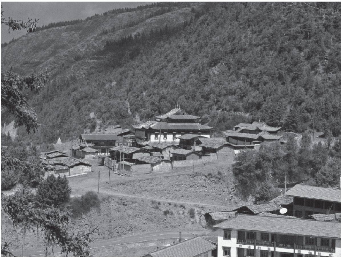
Plate 8: Gurba monastery ( Sgur ba dgon), the place of probable past Kyang family seat.

The area near Dzorge ( mDzod dge ) and in Thewo ( The bo ) is full of various stone imprints attributed to him (imprints left by the hoof of his horse, his