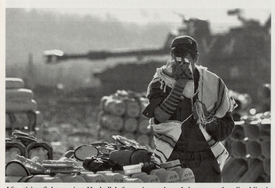
After tiring fights against Hezbollah forces in southern Lebanon, an Israeli soldier is taking a break.

One key question is how this situation will change with time, and whether the deployment of the Lebanese Army and a UN peacekeeping force will truly erode Hezbollah power, and Iranian and Syrian influence over time. This now seems doubtful. Hezbollah remains on the ground