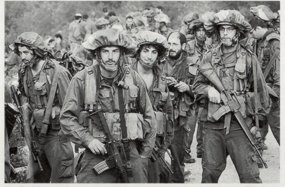
Israeli soldiers on the move into southern Lebanon. A substantial portion of the intervening ground forces were mobilized reservists.

A massive interdiction campaign was clearly conducted throughout the southern road net south of Beirut and Zaleh in the north extending south along the coast to Sidon, Tyre, and Nabatiyeh; and the roads south from the Bekaa to Marjayoun and Khiam. This attack seems to have included numerous strikes on suspect vehicles, many