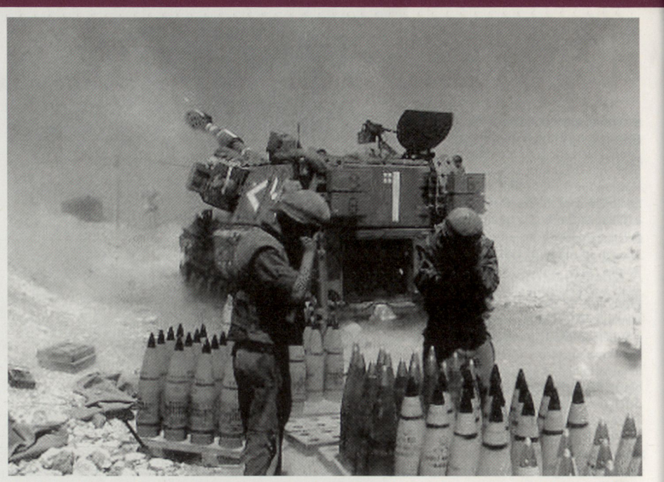
M-109 self-propelled howitzers at a northern Israeli fire base are providing artillery fire support to ground units in southern Lebanon.

The key issues for the US are what can be done to change this situation to reduce civilian casualties and collateral damage, and how can the US learn from the IDF's experience as well as its own. In all but existential conflicts, understanding these issues involves learning how to fight in built-up and populated areas in ways than deprive the enemy as much as possible of being able to force the US and its allies to fight at their level and on their own terms.