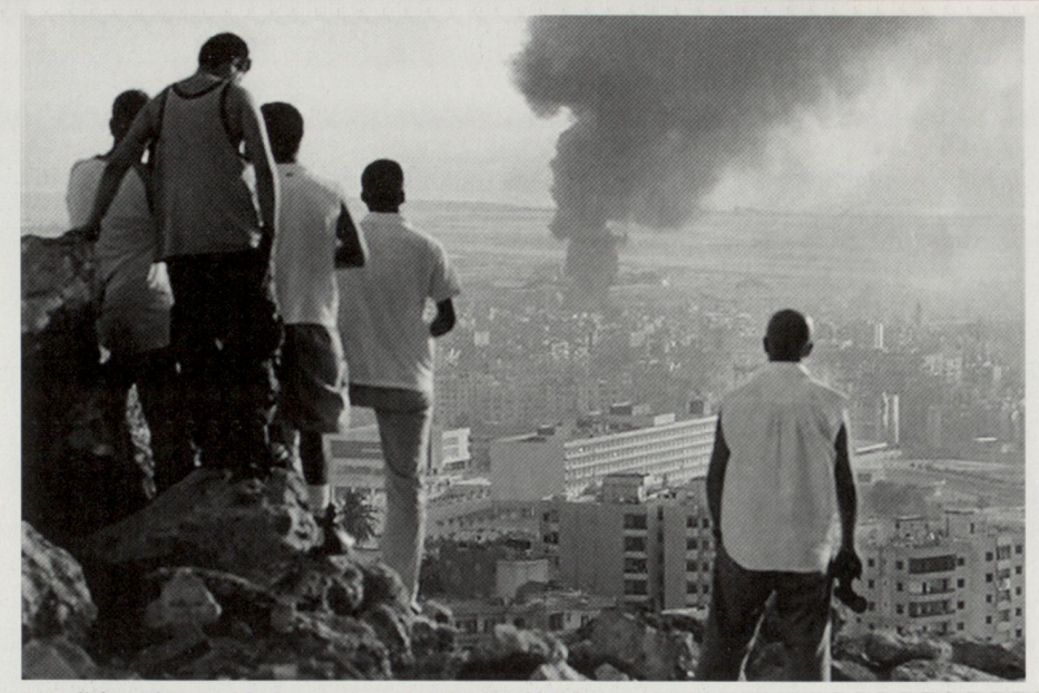
Israeli bombs are hitting targets in Beirut, Lebanon.

Only access to the historical record can determine the facts. There was, however, broad criticism that the government and IDF did not properly prepare the active forces and reserves for a major land attack or for the possibility of a major escalation that required such an attack. The government and IDF were criticized for never examining "Plan B" – what would happen if things went wrong or if a major escalation was required.