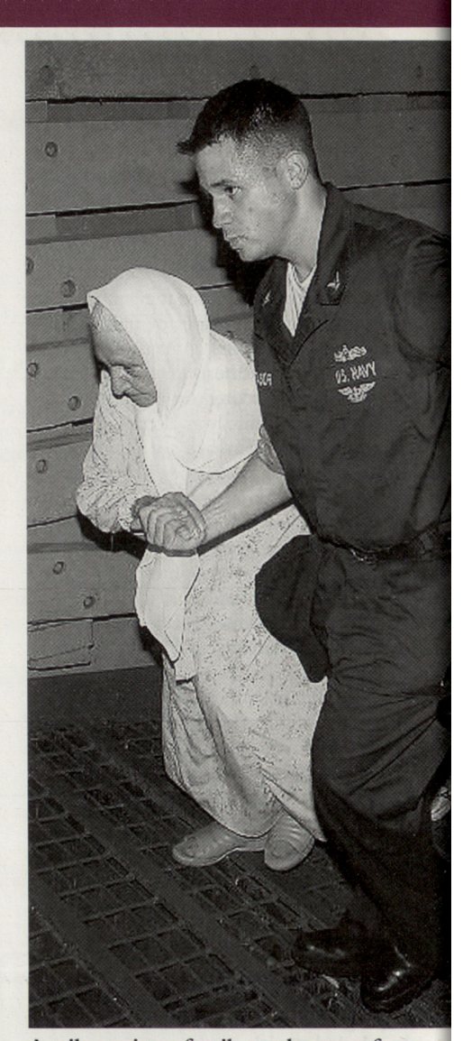
A sailor assists a family up the ramp from the well deck aboard the amphibious transport dock ship USS Trenton (LPD 14) off the coast of Beirut, Lebanon, during an evacuation operation on 23 July 2006.

There are, however, broader issues involved. Wars against political and ideological enemies are almost impossible to win by attacking their combat forces. Such enemies do more than fight wars of attrition, they carry out ideological, political, and media battles of attrition. There almost always are more leaders and more volunteers. They can disperse, pause, outwait, and adapt. A senior US officer and a government expert commenting on the war drew the following lessons about the ways in which Israel's behavior played into Hezbollah strengths, and the similarity of the lessons Israel should learn to the lessons the US should draw from Iraq and Afghanistan.