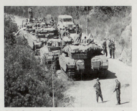
A column of Israeli Merkava combat tanks is moving from northern Israel into southern Lebanon.

The present ceasefire efforts assume that what began as a pause can be turned into a real and lasting set of security arrangements. Both Israel and the Hezbollah are likely to see the ceasefire and security arrangements as presenting both a risk and