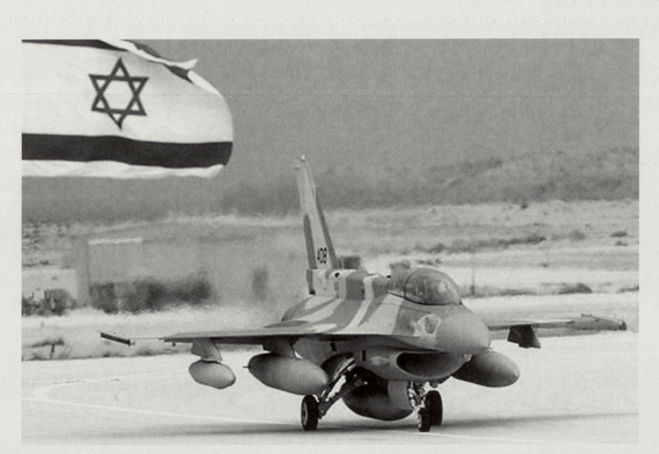
A large part of the Israeli Air Force is equipped with different versions of the F-16 (A, B, C, D and I versions) fighter/bomber. It normally carries the bulk of air operations. Here an F-16I aircraft is preparing for take-off.

<sup>1</sup>Israeli Defense Force sources as quoted by Alon Ben-David, "Israel Introspective After Lebanon Offensive," Jane's Defense Weekly , August 22, 2006, pp. 18–19.