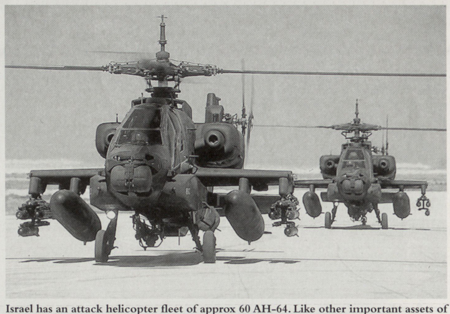
the Air Force, it carried a large proportion of the air war against the Hezbollah in Lebanon.

The ratio of casualties is also scarcely one that implies a major victory. Israel lost some 118 killed out of some 3,000–15,000 troops deployed into combat areas during various periods of the war. Even a bestcase loss ratio of 6:1 is scarcely a victory for Israel, given its acute sensitivity to casualties.