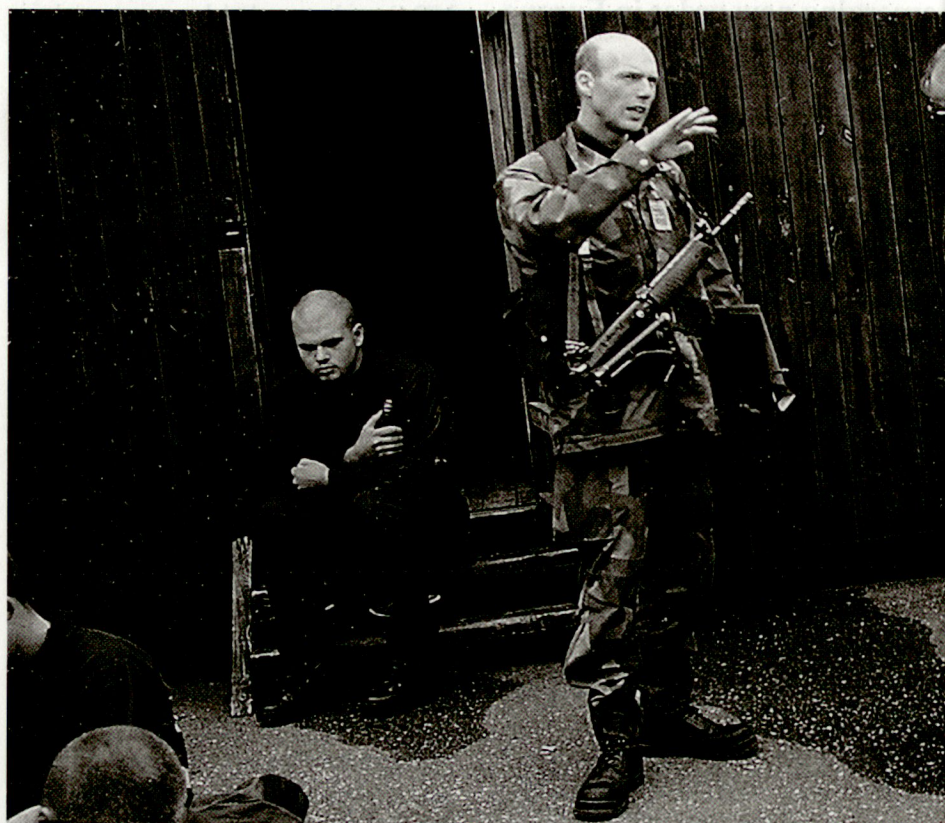
Exercise «DALECARLIA»: The Dalecarlian POW camp-commander under dis

The idea of training members (a chamber) of the Commission – as part of the willingness to check its capability and to keep up the preparedness – was proposed by Sweden in 1997. After a positive answer it was decided