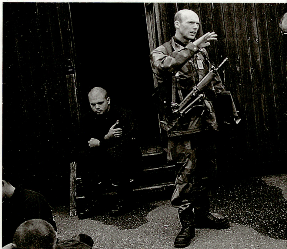
Exercise «DALECARLIA»: The Dalecarlian POW camp-commander under dis

The idea of training members (a chamber) of the Commission – as part of the willingness to check its capability and to keep up the preparedness – was proposed by Sweden in 1997. After a positive answer it was decided