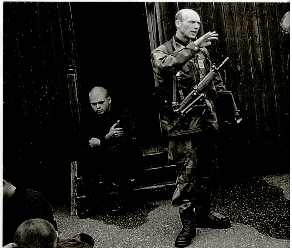
Exercise «DALECARLIA»: The Dalecarlian POW camp-commander under dis

The idea of training members (a chamber) of the Commission – as part of the willingness to check its capability and to keep up the preparedness – was proposed by Sweden in 1997. After a positive answer it was decided