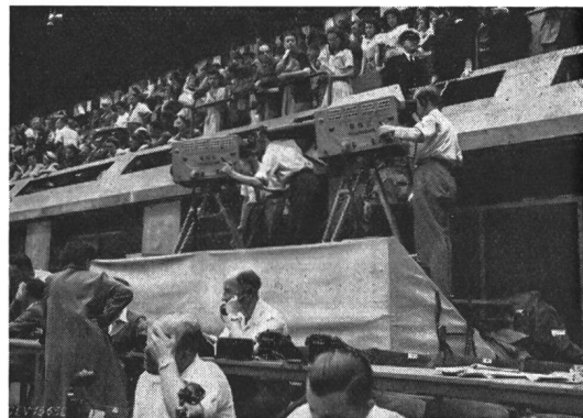
Fig. 1. The new «CPS» cameras in action at the Olympic Games (Swimming events)

any inherent noise. Although it is still undergoing development and is expected to be further improved, it already shows much promise and should prove particularly valuable for use out of doors in bad light as well as for theatres and other indoor subjects under their normal lighting conditions.