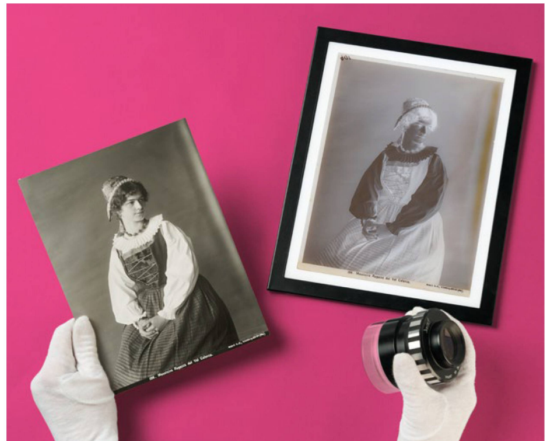
Photograph publisher Wehrli AG

During the year under review, over 13,000 pictures from the Prints and Drawings Department in the public domain were uploaded to the Wikimedia Commons (WMC) platform, bringing the total number to 38,000. Growth in the number of hits was pleasing with a total of 20.5 million (2023: 16.8 million). This was partly due to a two-day GLAM on tour event held with Wikimedia CH in June 2024. The event featured digitised images from the archive of photograph publisher Wehrli AG , which merged with Photoglob 100 years ago.