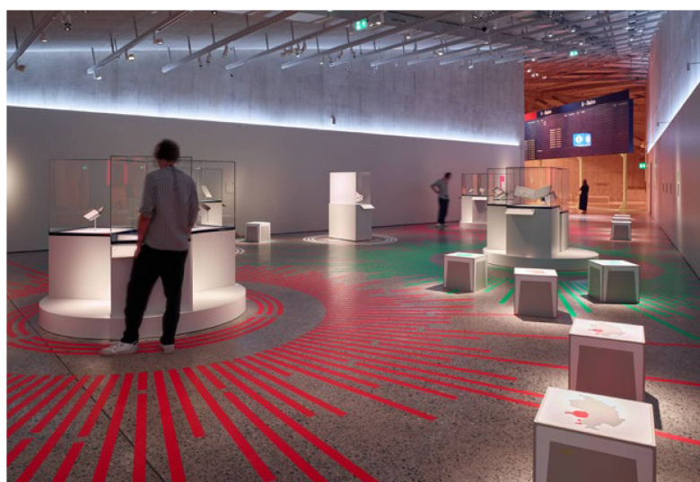
Multilingual Switzerland A look at the exhibition

From 16 to 18 June 2023, the National Sound Archives was guest of honour at Passionvinyl festival in Mézières (FR). From 21 to 24 September, it also had a stand at the Eidgenössisches Volksmusikfest, a musical event of national significance held in Bellinzona with over 80,000 visitors. The National Sound Archives visited the Archivi viventi. Revival, Restituzione, Roberto Leydi conference, organised by the Centre for Dialectology and Ethnography and the Swiss Society for Ethnomusicology from 17 to 19 November because of the Roberto Leydi archive stored there. From 25 to 27 November, it also