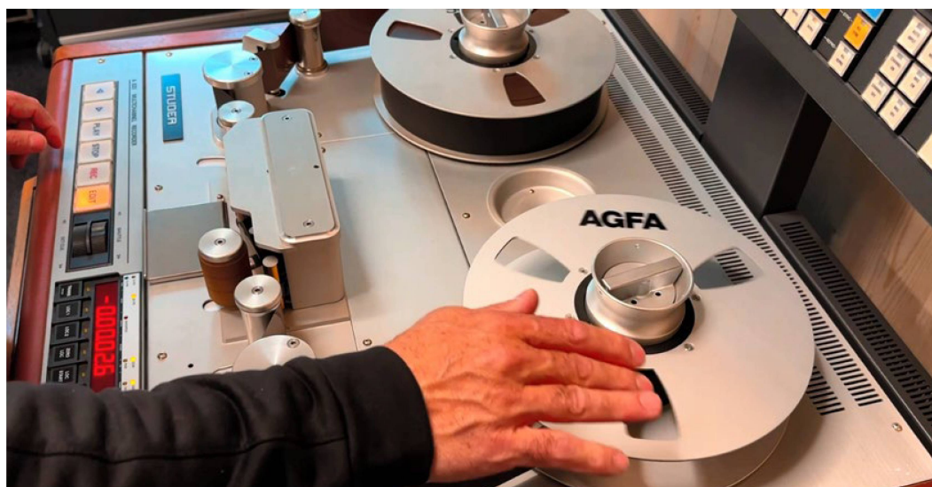
The sound machine of the month Studer A820 magnetic tape recorder

Finally, the Swiss National Sound Archives shared brief video clips of historical audiovisual machines and devices under the title The sound machine of the month on its YouTube channel.