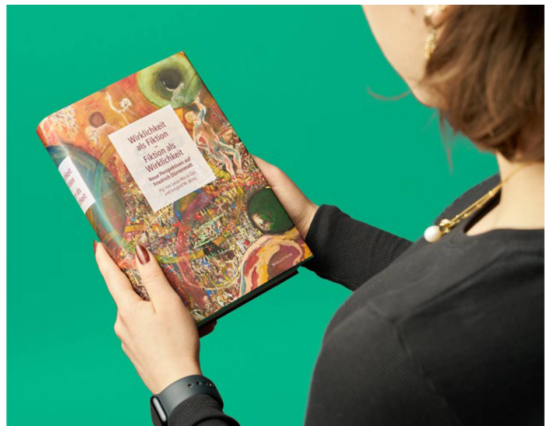
Wirklichkeit als Fiktion. Fiktion als Wirklichkeit. New perspectives regarding Friedrich Dürrenmatt

Conference publication (in German) Wirklichkeit als Fiktion. Fiktion als Wirklichkeit . Neue Perspektiven auf Friedrich Dürrenmatt (Truth as fiction. Fiction as truth. New perspectives on Friedrich Dürrenmatt) featuring 30 articles and interviews