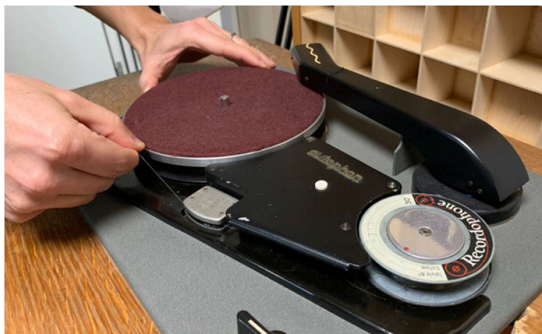
Sound machine of the month

Public interest in the National Sound Archives' collection remains very high, with 772,390 database requests recorded in 2022 (2021: 634,247). The Swiss School of Violin Making in Brienz was added to the 58 institutions in Switzerland with one or more audiovisual workstations that can be used to access the National Sound Archives database.