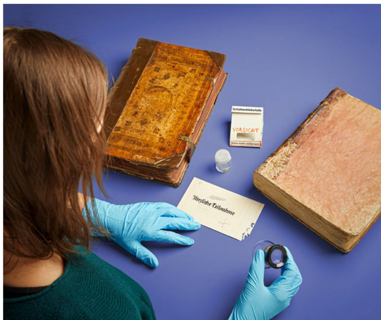
Integrated Pest Management Pest control measures

In 2022 the Swiss National Library had 2,017 active users of the General Collection, just under 20% fewer than in the previous year (2021: 2,415). The trend towards use of digital services which are available without enrolment continued. A total of 42,317 documents were