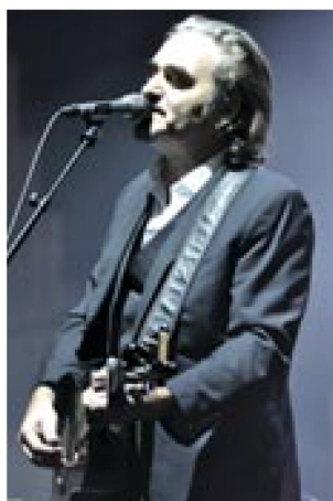
Stephan Eicher