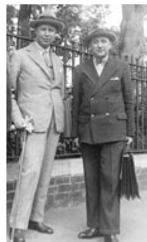
Piero Coppola with Sergej Prokofiev