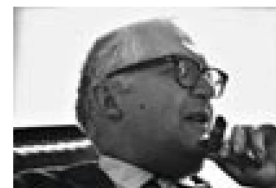
Friedrich Dürrenmatt

The Swiss National Sound Archives played host to the 2021 annual congress of the Germany/Switzerland branch of the International Association of Sound and Audiovisual Archives – IASA. The event was held online and was used by the Swiss National Sound Archives as an opportunity to present the institution and its activities to a specialist audience and to network. The two-day congress was attended by around a hundred participants.