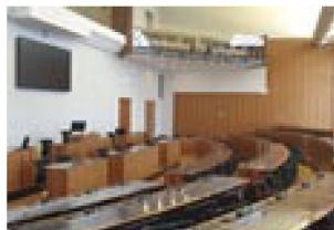
Lugano municipal council chamber

Once again in 2021, the Swiss National Sound Archives worked to preserve and mediate Switzerland's audio heritage in collaboration with various institutions. For example, together with the administrative archives of the city of Lugano and the Memoriav association, it launched a project to safeguard audio recordings of meetings of the Lugano municipal council between 1962 and 2003. It also acquired important collections, such as those of the Swiss band More Experience and Zurich's Widder Bar. In addition, to mark the centenary of Friedrich Dürrenmatt's birth, it released a phonography on the Swiss writer and painter.