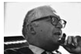
Friedrich Dürrenmatt

The Swiss National Sound Archives played host to the 2021 annual congress of the Germany/Switzerland branch of the International Association of Sound and Audiovisual Archives – IASA. The event was held online and was used by the Swiss National Sound Archives as an opportunity to present the institution and its activities to a specialist audience and to network. The two-day congress was attended by around a hundred participants.