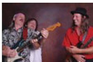
The Jimi Hendrix cover band More Experience