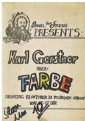
Daniel Spoerri presents: Karl Gerstner über Farbe , 1978, poster