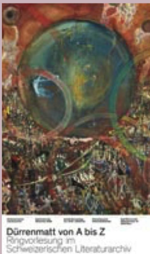
Dürrenmatt von A bis Z: a cycle of 14 lectures