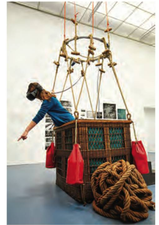
Exhibition visitors were able to take a virtual-reality balloon ride using special glasses

A total of 7632 people attended cultural events at the NL in Bern, significantly less than 2018, which was an exceptional year thanks to the exhibition LSD. A Problem Child . The exhibition Von oben. Spelterinis Ballon und die Drohne took the NL's collections as the starting point for a virtual-reality balloon flight.