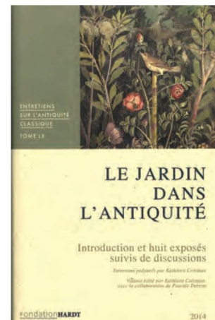
Entretiens sur l'antiquité classique vol. 60, 2014

Regular analyses indicate that occupancy of the stacks has reached 50% of the capacity limit. According to the most recent forecasts and assuming that at some point the entire stacks area is given over to the NL, the capacity limit is expected to be reached in 2040.