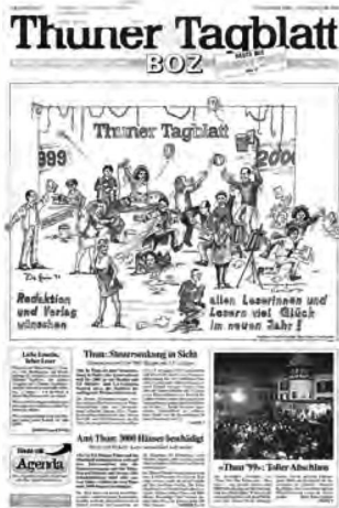
Thuner Tagblatt, 31.12.1999

The General Collection's activities and results were primarily shaped by three factors: work on the new library management system, the impact of the building situation, and alignment with the new strategy that comes into force in 2020.