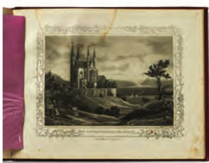
Illustration in the Album des Rheins , ca. 1860

Following its redesign in 2018, the NL's website ( www.nb.admin.ch ) continues to be updated regularly. In social media, the NL is active on Facebook , Twitter and Instagram . It also maintains a YouTube channel on which it posts videos on relevant topics and its exhibitions. In all, the NL's German-language Facebook page has almost 11 000 followers and the French-language page more than 9000. The NL's German Twitter feed has just under 2500 followers and the French-language version almost 1700. Since it was launched in 2018, the multilingual Instagram feed has accumulated just over 600 subscribers, and this figure continues to grow.