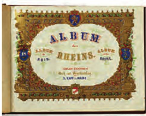
Title page of the Album des Rheins , ca. 1860

e-Helvetica , the NL's long-term archiving system, was migrated to the infrastructure of the Swiss National Sound Archives in Lugano, in a first step towards merging it with the digital audio archive. Preparatory work on the project to replace the current digital long-term archive and merge the digital audio archive with e-Helvetica subsequently commenced.