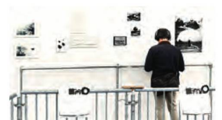
Photographing with drones