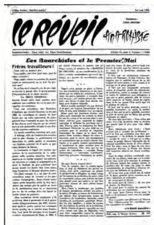
Réveil anarchiste, 01.05.1960