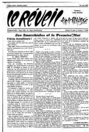
Réveil anarchiste, 01.05.1960

As part of work to develop the new strategy, particular attention was devoted to activities relevant to its implementation. These included a redesign of e-Helvetica Access , the system for accessing digital documents. For the first time, a crowdsourcing exercise was carried out, whereby private individuals helped to improve the results of newspaper digitisation. The exhibition Von oben. Spelterinis Ballon und die Drohne took the NL's collections as the basis for a virtual-reality balloon ride experience.