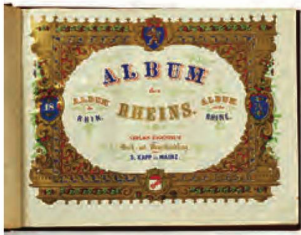
Title page of the Album des Rheins , ca. 1860

e-Helvetica , the NL's long-term archiving system, was migrated to the infrastructure of the Swiss National Sound Archives in Lugano, in a first step towards merging it with the digital audio archive. Preparatory work on the project to replace the current digital long-term archive and merge the digital audio archive with e-Helvetica subsequently commenced.