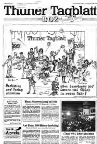
Thuner Tagblatt, 31.12.1999

The General Collection's activities and results were primarily shaped by three factors: work on the new library management system, the impact of the building situation, and alignment with the new strategy that comes into force in 2020.