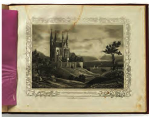
Illustration in the Album des Rheins , ca. 1860

Following its redesign in 2018, the NL's website ( www.nb.admin.ch ) continues to be updated regularly. In social media, the NL is active on Facebook , Twitter and Instagram . It also maintains a YouTube channel on which it posts videos on relevant topics and its exhibitions. In all, the NL's German-language Facebook page has almost 11 000 followers and the French-language page more than 9000. The NL's German Twitter feed has just under 2500 followers and the French-language version almost 1700. Since it was launched in 2018, the multilingual Instagram feed has accumulated just over 600 subscribers, and this figure continues to grow.