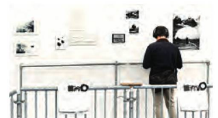
Photographing with drones