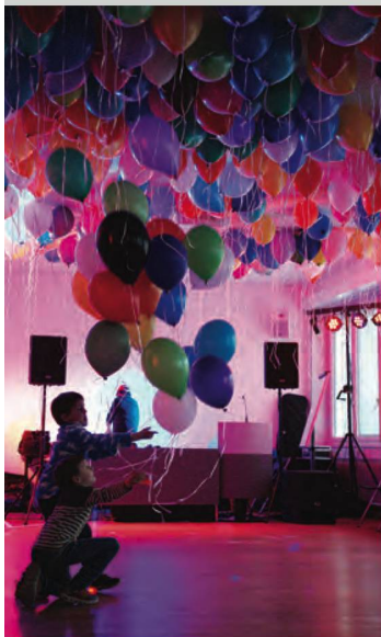
Children had the chance to release balloons on Museum Night