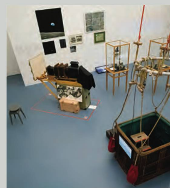
View of the exhibition gallery from above