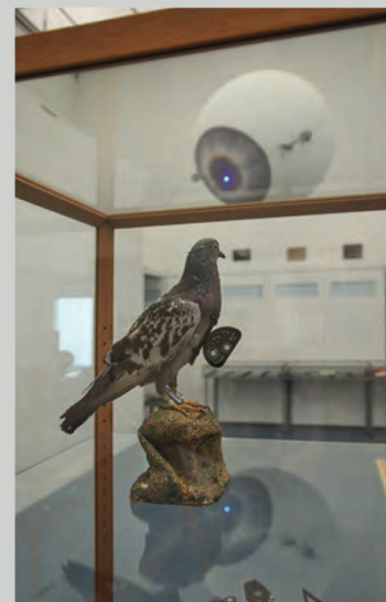
Image-recording technologies past and present

The exhibition took Spelterini's photographs from the National Library's Department of Prints and Drawings as the starting point for a history of aerial photography in Switzerland. Originated by enterprising pioneers in the century before last, the medium has now been opened up to anyone with the advent of drones. Historical images, a virtual-reality balloon flight, photographs taken from aeroplanes and satellites as well as drone images enabled visitors to see the world from a different perspective.