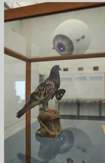
Image-recording technologies past and present