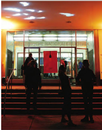
Late-night museum visitors at the entrance to the National Library