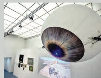
The drone kept the exhibition in view the whole time