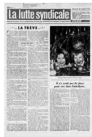
Some ten trade union newspapers were made available online