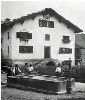
Scene of everyday life in Breil-Brigels (GR) around 1905, by Rudolf Zinggeler

The number of on-site users fell to 455 in 2018 (2017: 516), but information and research requests recorded a further rise, to 952 (2017: 823).