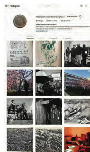
The NL opened its Instagram account in October 2018

More than 10 600 people attended cultural events at the NL in Bern, compared with more than 9600 in 2017. This increase is largely due to the success of the exhibition LSD. Ein Sorgenkind wird 75 . The Centre Dürrenmatt Neuchâtel received almost 9000 visitors, compared with just over 8000 in 2017.