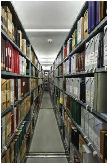
The VIVA project catalogued a wide range of documentation on the life of Swiss associations and institutions

The NL collects not just printed matter but also digital material. The volume of the digital collection reached around 25 TB at the end of 2018 (2017: 21 TB). At the end of the year in review, digitally born publications accounted for more than 130 000 archive packages, around 20% more than in 2017 (more than 107 000). There are a further 42 577 archive packages containing digitised material (2017: 42 489). The project to migrate the e-Helvetica archiving system to the servers of the National Sound Archives is nearing completion.