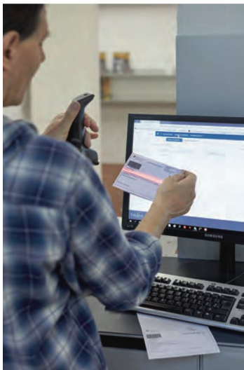
The main event of 2018 was the switch to a new library management system