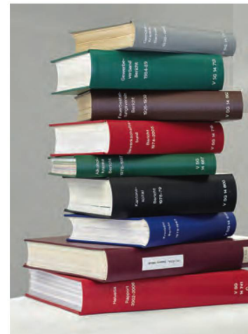
For conservation purposes, the NL binds all works as they arrive