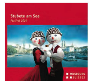
Stubete am See