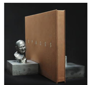
Urs Lüthi, Serre-livres (Bookends) , 2011