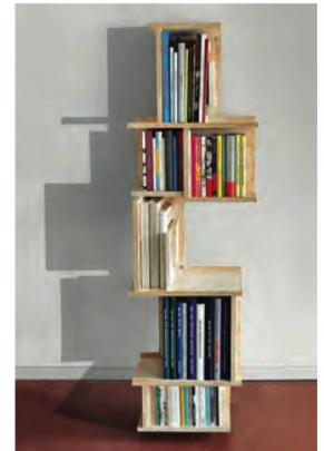
Johannes Gachnang, original library furniture

With these acquisitions, the Prints and Drawings Department strengthens its position as a centre of research into the production of artist's editions in Switzerland.