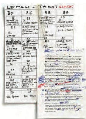
Writings by Pierre Imhasly