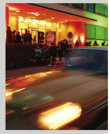
A special atmosphere in front of the NL, with classic cars from the Oldtimer Club Bern shuttling between the various locations taking part in Museum Night