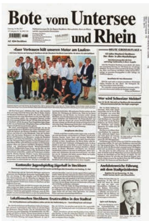
Bote vom Untersee und Rhein , no. 38 (16.5.2017)