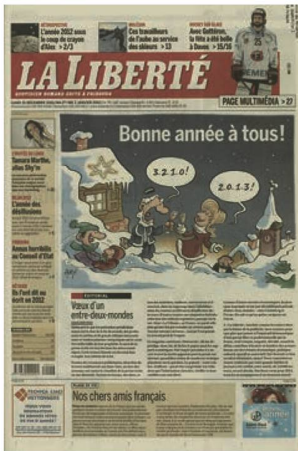
La Liberté , no. 75 (31.12.2012, 1./2.1.2013)

At the end of 2017, a total of 27 720 volumes from the NL's collections were available online. That figure corresponds to 0.7% of the 3 951 692 books and volumes of newspapers or around 16.3 million pages (2016: 14.7 million pages).