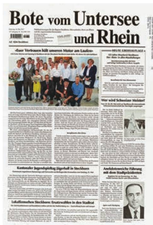
Bote vom Untersee und Rhein , no. 38 (16.5.2017)