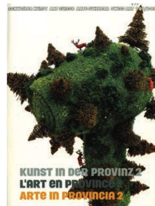
Schweizer Kunst, no. 1/2 (2009)

The NL staged two exhibitions in Bern: What Lenin Read. The Revolutionary in the National Library and the trilingual project Rilke and Russia . Both were well received by both visitors and the media.