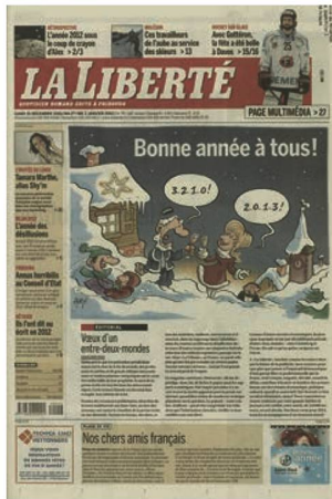
La Liberté , no. 75 (31.12.2012, 1./2.1.2013)

At the end of 2017, a total of 27 720 volumes from the NL's collections were available online. That figure corresponds to 0.7% of the 3 951 692 books and volumes of newspapers or around 16.3 million pages (2016: 14.7 million pages).