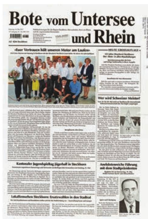
Bote vom Untersee und Rhein , no. 38 (16.5.2017)