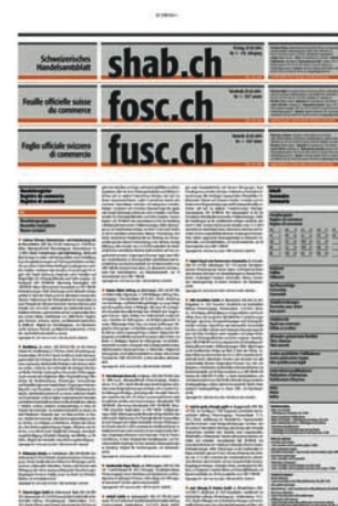
Swiss Official Gazette of Commerce, 1 (2014)