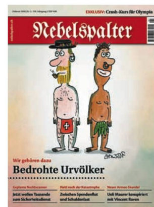
Nebelspalter , 1 (2010)

In 2016 the SLA published an issue of Quarto 18 , while the CDN published four new Cahiers des CDN . 19 The last two, nos 13 and 14, were related to the exhibitions Ionesco – Dürrenmatt. Peinture et théâtre and Jean-Christophe Norman – Matières .