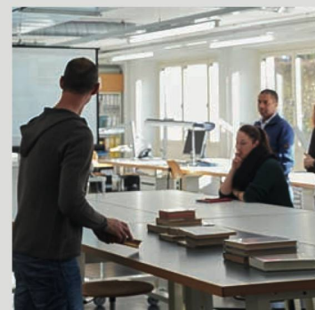
Conference on the role of conservation in digitisation projects, 17.11.2016