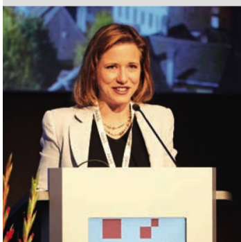
Christa Markwalder, President of the National Council, opens iPRES 2016, 3.10.2016

The seventh SLA summer academy at the CDN mapped out the scope of the various avant-gardes, with lectures, seminars, podium discussions and screenings of films on Avant-gardes and Avant-gardism .