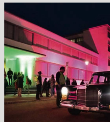
Museum Night in Bern, 18.3.2016

A particular feature of Museum Night in Bern is the Fahrendes Museum , a fleet of classic cars in which visitors are chauffeured around. In 2016 the stipulated route started at Bellevue in Bern and ended at the entrance to the NL. Here the theme for the night was Dada, with workshops where children could write Dada poems and make masks. The programme for adults was devoted to the two key figures in the movement's initial phase. An actor read poems and texts by Emmy Hennings, while a stage and radio play presented three aspects of Hugo Ball's dazzling personality: Dadaism, anarchism and Catholicism.