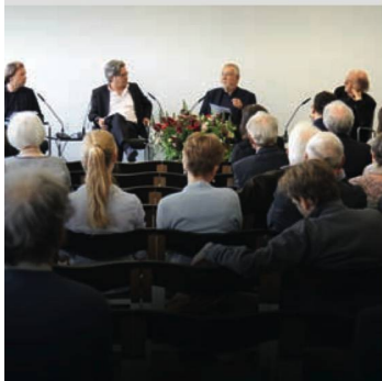
Vernissage of the Quarto issue Graz sei Dank! 18.5.2016