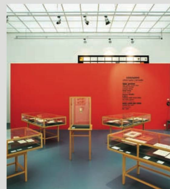
DADA original, 7.3.–28.5.2016

Marking 100 years since the founding of the artists' movement known as Dada, the SLA exhibition looked at its initial phase, in particular Hugo Ball and Emmy Hennings. In addition to Ball's legendary Dada Manifesto , a number of other original documents from Ball and Hennings' literary estates were on display, including pictures, letters and texts. One particular focal point was a selection of portrait photographs revealing the many facets and faces of Emmy Hennings. Materials from the Arche Verlag publishing house in Zurich documented the history of Dada's post-facto reception.