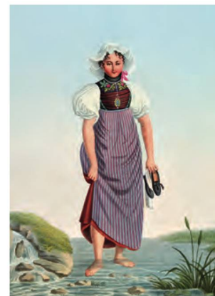
From: Jean Emmanuel Locher and Markus Dinkel, Recueil de portraits et costumes suisses les plus élégants [...] Publié par J. P. Lamy, à Berne et Bâle, ca. 1820 (section)

Progress in cataloguing is having an impact on user services. The number of active users rose from 548 to 601, the number of units lent out from 991 to 1248. Information and research requests rose only marginally, to 953 compared with 937 in the previous year. These figures reflect use on site. The strong presence on Wikimedia Commons allows for broad online usage. 33