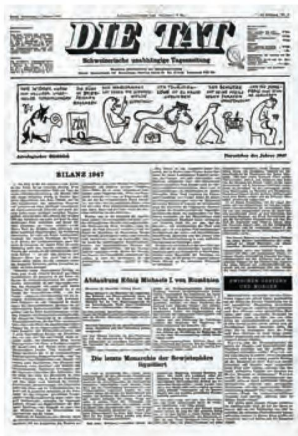
Die Tat, 1.1.1948