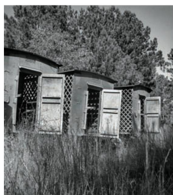
Annemarie Schwarzenbach, images for the photoreportage Das Drama im amerikanischen Plantagengürtel. Glanz, Sturz und neues Leben... in den Südstaaten von U.S.A. , published in Zürcher Illustrierte no. 24, 10.6.1938. The pictures form part of the literary estate of Annemarie Schwarzenbach in the SLA and, together with others, are reproduced in Quarto 39 Schreiben im Gefängnis .