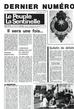
Front page of the last issue of Le Peuple La Sentinelle , Neuchâtel-Jura edition, 19th May 1975