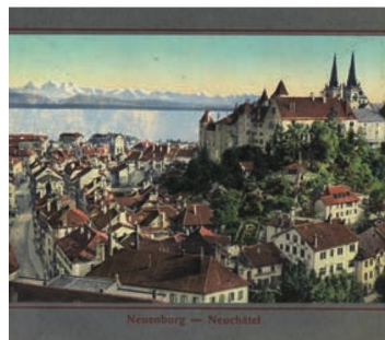
Vue de Neuchâtel, in: Die Schweiz = La Suisse , Neuchâtel, Maison Timothée Jacot, W. Bous, around 1900