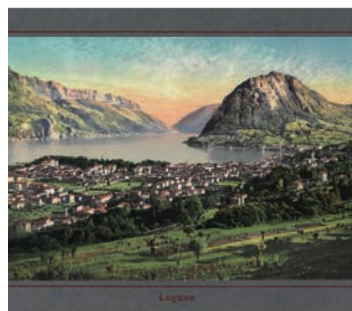
Vue de Lugano, in: Die Schweiz = La Suisse , Neuchâtel, Maison Timothée Jacot, W. Bous, around 1900