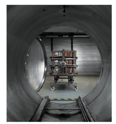
Papersave swiss plant, Wimmis. A "charge" awaits deacidification.