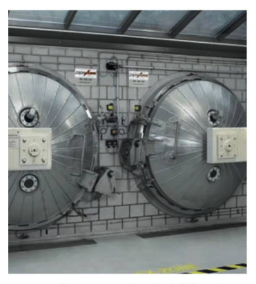
Papersave swiss plant, Wimmis. Both chambers are closed. The plant is in operation.

is being looked into. We are examining the introduction of automatic indexing processes for electronic publications that have not so far been subject indexed. Over the long term, this should lead to an increase in the proportion of documents with subject indexing data.