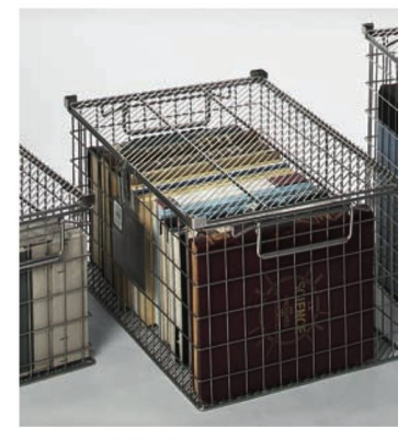
Paper deacidification: transport baskets

Work on introducing the combined authority file (GND) for formal indexing continued during the year in review. Subject indexing has been carried out using the GND since 2013. Since July 2014 it has also included new keywords in accordance with the binding Resource Description and Access (RDA) regulations. Our subject indexing policy has been revised, allowing us to extend it to electronic documents in future while maintaining the same resources. Under the new policy, manual subject indexing is carried out only for printed publications with a thematic link to Switzerland. With regard to other printed documents, automatic ingest of data from other libraries