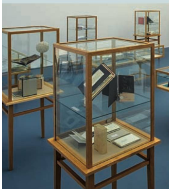
Unikat – Unikum, 22.11.2014– 28.2.2015