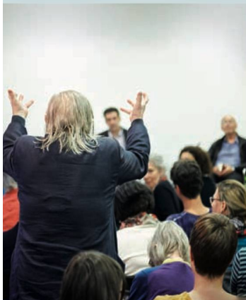
Franco Beltrametti soirée, 24.9.2014