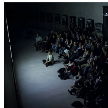
Museum Night at the CDN, 18.5.2013