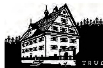
Anton Bruhin, Bündner Bauten , Zurich, 2012, Edition Marlene Frei, folder with 8 plates. The images show, from top to bottom: Lumbrein 456, Trun 463, Sufers 465, © the artist