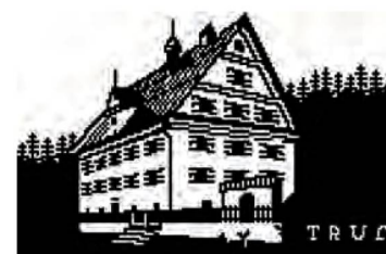
Anton Bruhin, Bündner Bauten , Zurich, 2012, Edition Marlene Frei, folder with 8 plates. The images show, from top to bottom: Lumbrein 456, Trun 463, Sufers 465, © the artist