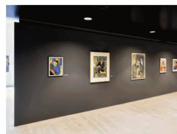
View of the exhibition Friedrich Dürrenmatt – Portraits et autoportraits (18.07.–16.09.2012)