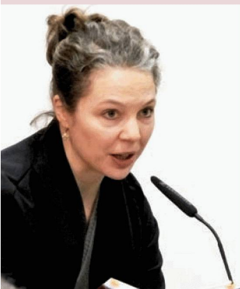
Melinda Nadj Abonji, 2.3.2011