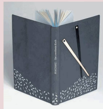
2nd prize in the bookbinding competition for apprentices: Luca Stauffer's binding