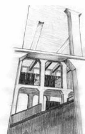
The Swiss National Library, view of the upper levels, drawing: Saskia Buntschu