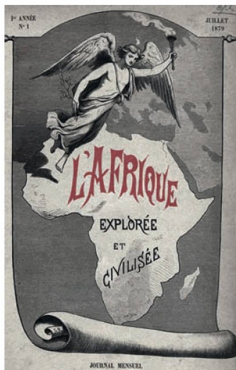
One of the digitised periodicals: L'Afrique explorée et civilisée , title page of the 1st issue, July 1879

Highlights of cultural outreach included the series of events marking 20 years of the SLA 31 in Bern and the exhibition on Mario Botta 32 at the Centre Dürrenmatt Neuchâtel (CDN). In all, 6312 people (2010: 8341) attended an exhibition, event or guided tour in the NL. This decline reflects the fact that no major exhibition was staged. The CDN was visited by 13 594 people (2010: 12 164), the highest number in its history.