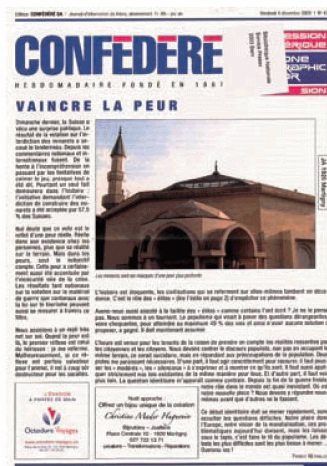
One of the digitised newspapers: Le Confédéré , title page of the 12 April 2009 issue