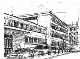
The Swiss National Library from the outside, drawing: Basil Linder

Workplaces recorded average occupancy of 36% over the year as a whole (2010: 39%). This decline in usage came in spite of the renovation of the public areas carried out in 2010, which was well received. Advertising in various media, including Facebook, succeeded in reversing this trend only for a few months. The technical infrastructure in the public areas is currently being redesigned, and this may result in a sustained increase in usage. Greater demand for WLAN access confirms that users wish to enjoy their customary technical resources in the library as well.