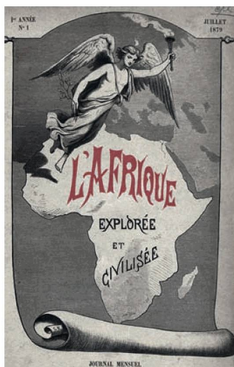
One of the digitised periodicals: L'Afrique explorée et civilisée , title page of the 1st issue, July 1879