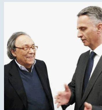
Jean Starobinski (left) in conversation with Federal Councillor Didier Burkhalter, 18.11.2010