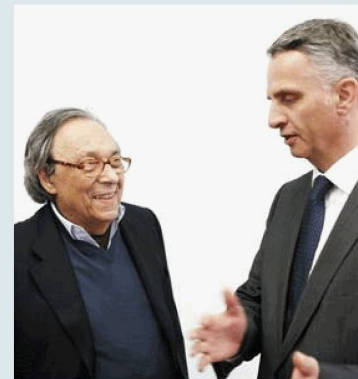
Jean Starobinski (left) in conversation with Federal Councillor Didier Burkhalter, 18.11.2010