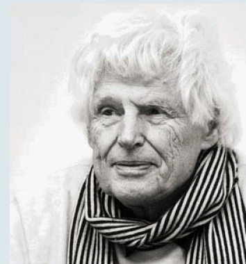
Jörg Steiner on 3.11.2010 in the NL

The fourth meeting of the Cercle d'études internationales Jean Starobinski, run jointly by the SLA and the University of Geneva, honoured Jean Starobinski on the occasion of his 90th birthday with a conference held in Bern and Geneva. Devoted to Starobinski's formulation "A distance de loge", which designates a moment in the hermeneutic circle distinguished by overhead panoramic vision following or preceding a period of intimate participation, the colloquium considered the variations on the related critical position as reflected in Starobinski's thinking about interpretation and in his work as an interpreter, as well as in the other social sciences.