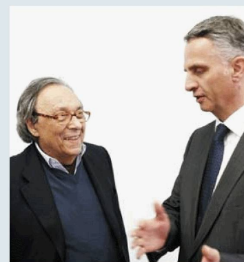
Jean Starobinski (left) in conversation with Federal Councillor Didier Burkhalter, 18.11.2010