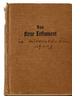
From the library of Ludwig Hohl