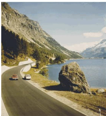
Upper Engadine around 1960