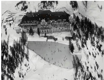
St. Moritz, aerial photograph of the Hotel Suvretta-Haus in winter, photo Swissair Photo and Vermessungen AG, Zurich, around 1920