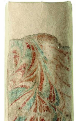
After conservation: spine, posters

The collection of digitally born documents 14 was enhanced with 2493 additional publications and at the end of 2009 contained some 11 million files comprising a total of 136 gigabytes (2008: 1406 publications, 15 300 files, 7.91 GB). Of particular note is the archiving of the online edition of the Swiss Official Gazette of Commerce . Its daily editions comprise around 1500 entries, each of which the NL archives and stores long-term along with its legally valid signature. The collection of national information websites is being further expanded in collaboration with the Swiss cantonal libraries. Development of an instrument for user searches in the electronic collection is proceeding on schedule, and is due to be operational at the end of 2010.