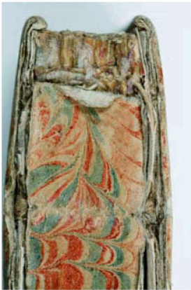
Before conservation: spine, posters