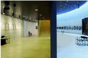
Caricatures: Bosc, Chaval, Sempé et Ungerer exhibition

The philosophical works in Friedrich Dürrenmatt's library, some 3000 volumes, were catalogued as part of the 'authors' libraries' project. Each book is described in HelveticArchives , its bibliographic information often accompanied by photographs of significant pages from the volume in question.