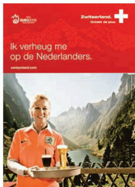
Documents of the European Football Championship Euro08 from the collection of association publications