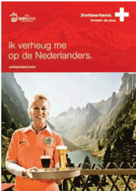
Documents of the European Football Championship Euro08 from the collection of association publications