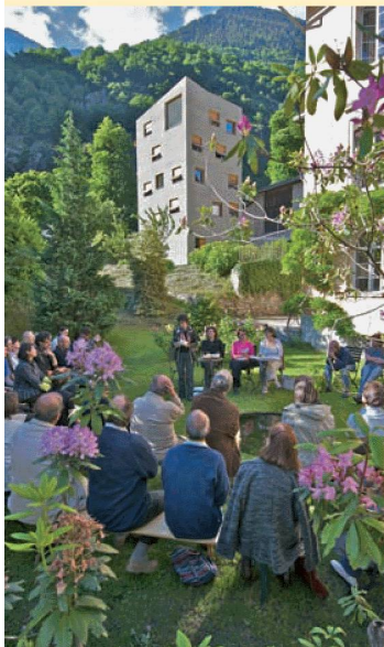
Opening Reception Quarto Bergell, © St. Moritz Press Photos

The poetry of Andri Peer is considered as modern, difficult, not uncommonly even as incomprehensible. The symposium in Lavin aimed to show that his lyrics also derive from tradition and offer manifold interpretations. The event was a co-production of La Vouta, the Swiss National Science Foundation, the University of Zurich and the SLA.