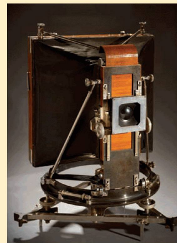
Meydenbauer photogrammetric measuring camera