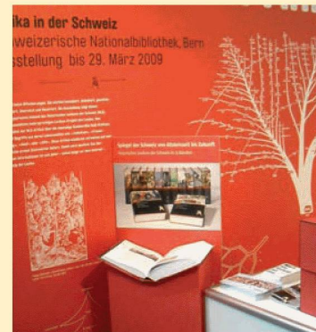
The NL at Book.08