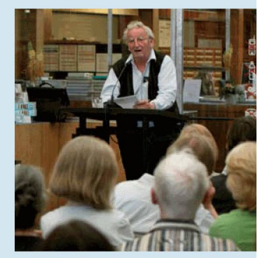
World Book Day: Peter Bichsel