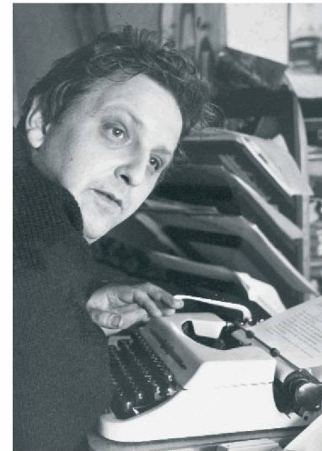
Peter Bichsel