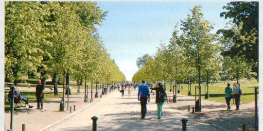
Lime tree path in the Kaivopuisto park, Helsinki, with «Treegator» water management, a system coming from England.