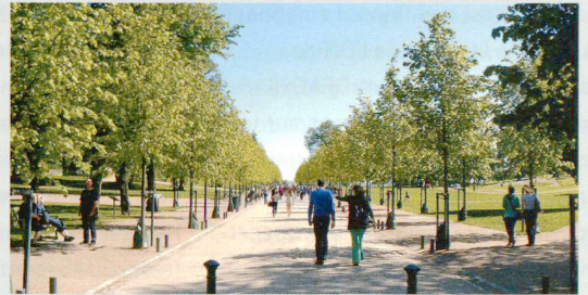
Lime tree path in the Kaivopuisto park, Helsinki, with «Treegator» water management, a system coming from England.