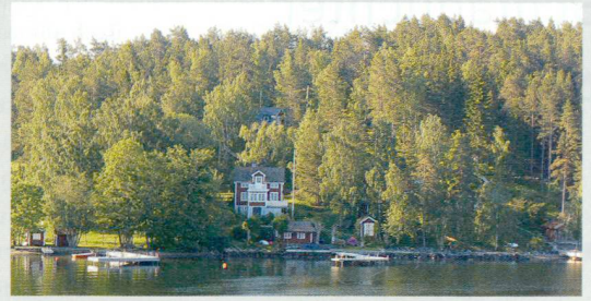
Typical landscape between Helsinki and Stockholm.

Walking in the Kaivopuisto park in Helsinki and on the sea front, was the occasion to discover other landscape man-