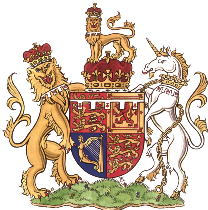
Arms of Prince Henry «Harry»

The design was approved by Prince William, his father, Prince Charles, and the Queen.