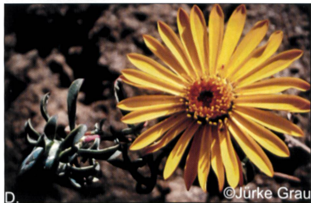
Linking the past with the present. Botanists have recognized the variation in the Chaetanthera subgenus Tylloma group of Chilean taxa for nearly 200 years. Modern analysis has enabled the complexities of this group to be revealed. A. An image of nomenclatural type material held in Geneva of Tylloma glabratum DC. Collected in Chile by Macrae in 1825 and annotated by A.-P. De Candolle himself, who described it as a new species in 1838. B. A closely related species, C. limbata , first described in 1830. Here it is, photographed in La Silla, Coquimbo. C. A species new to science - C. pubescens . D. C. frayjorgensis , a new name for a commonly collected plant.

genus Oriastrum and Oriastrum subgenus Egania (J. Rémy) A.M.R. Davies. Character variation is discussed in the context of form, function and habitat, with emphasis on the evolutionary adaptiveness of character traits seen in the two allied genera. Chaetanthera appears to show primary adaptation to cold and several secondary adaptations to arid conditions, typical of modern Chilean landscapes. Oriastrum taxa appear well-adapted to the cold, high elevations of the Andes, and show secondary developments trending towards an insular syndrome. The collated bio-geographical information of the taxa is considered in terms of endemism, hotspots and species radiations. Chaetanthera taxa have 2 loci of diversity hotspots in Chile – in Coquimbo and in Santiago. Trichome diversity and capitula morphology trends are used as evidence of species radiations in Chaetanthera . Oriastrum taxa are notable for parallel radiations of morphologically similar species within particular Andean zones: i.e., Altoandino or Altiplano. Case studies concerning three groups of Chaetanthera taxa are presented. The first case highlights the