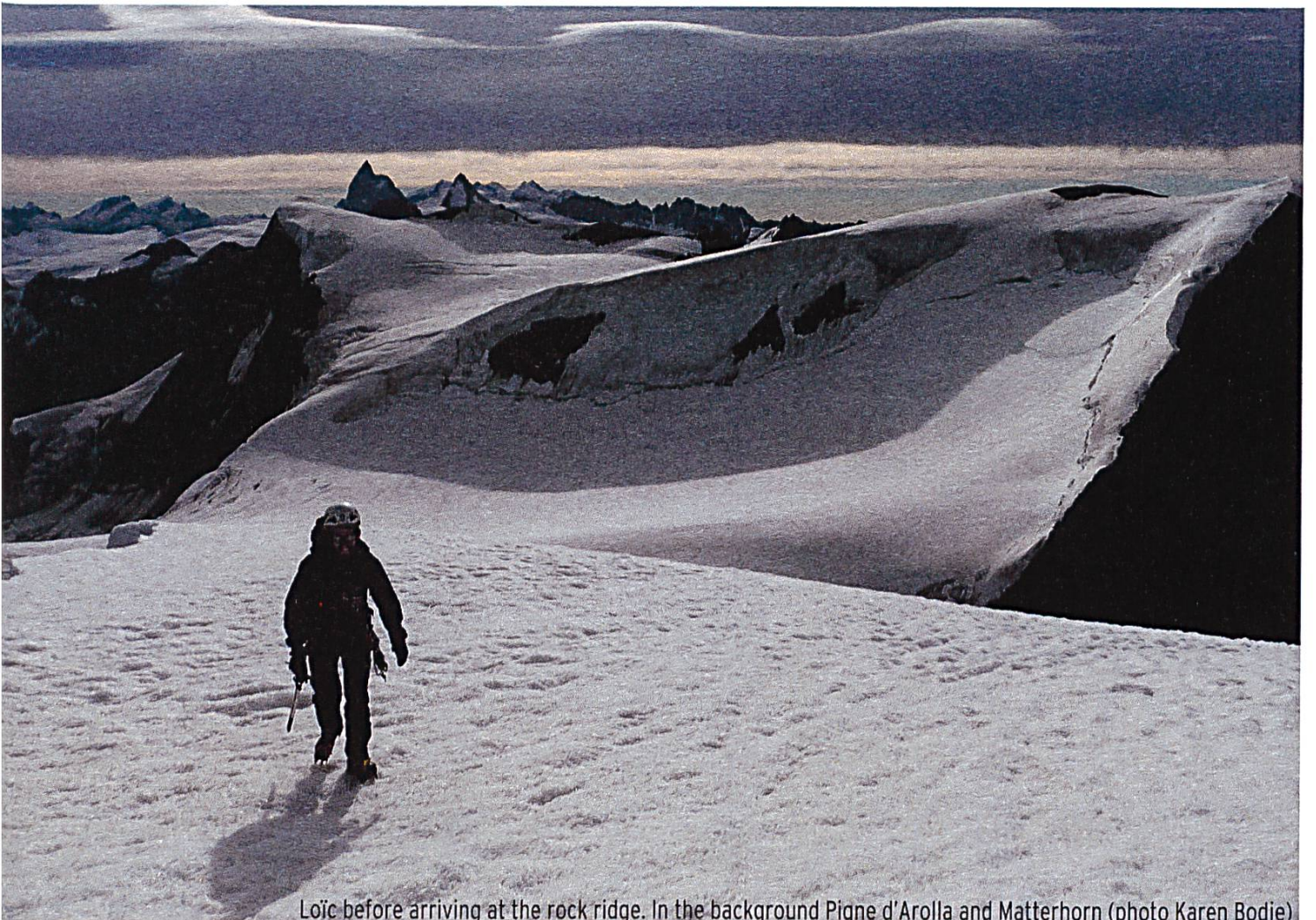
Loïc before arriving at the rock ridge. In the background Pigne d'Arolla and Matterhorn