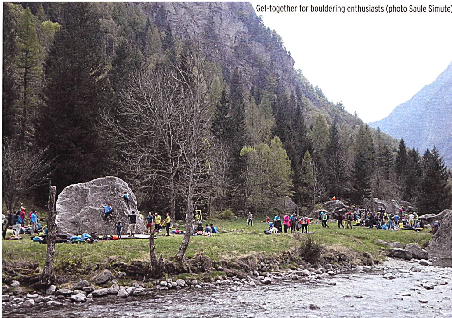
Get-together for bouldering enthusiasts