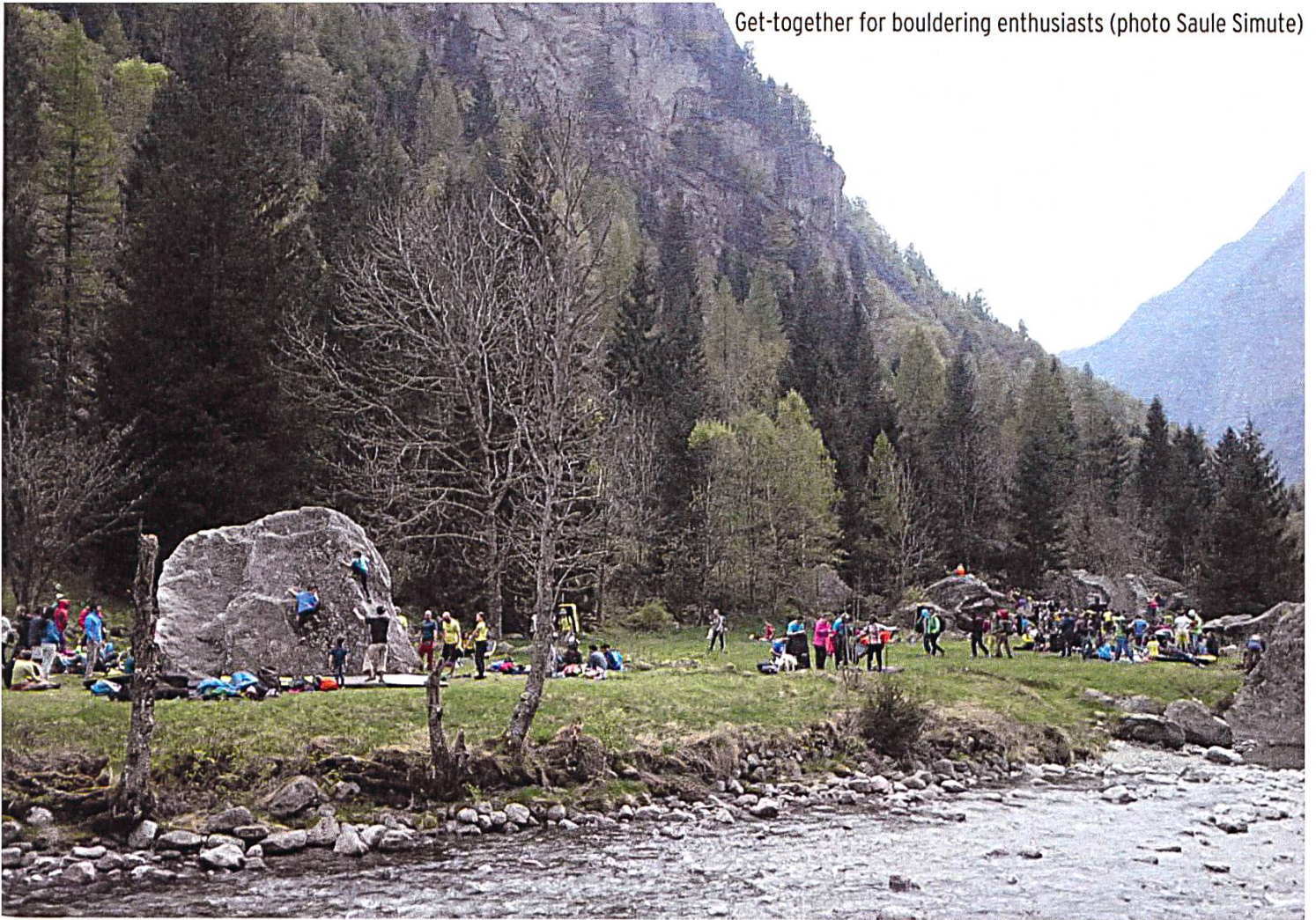
Get-together for bouldering enthusiasts